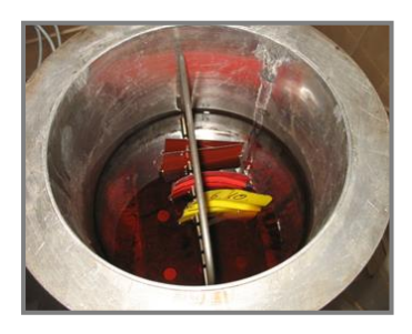
Internal coating fuel resistance test