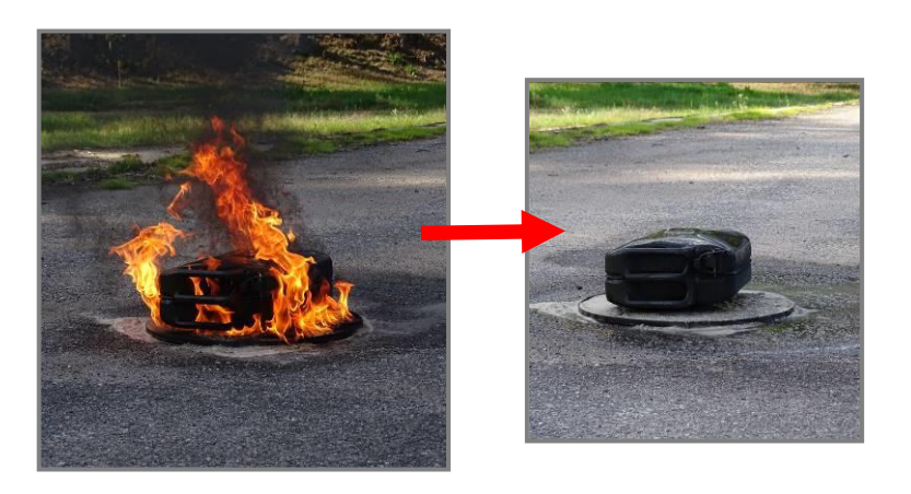
Fire and heat test

Can is filled with 10l fuel and it is placed in flames for 120 s.